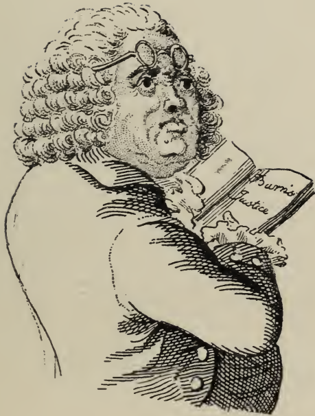
THE SHAM SQUIRE.